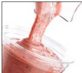
Unique shape and design for faster, smoother pouring.