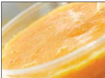
Perfectly blended smoothies.