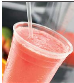
Strawberry Orange Smoothie