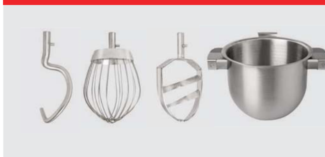
Hook, whip, beater and bowl 30/15 L in stainless steel.