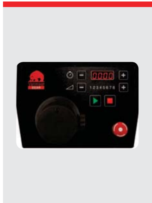
Attachment drive for meat mincer and vegetable cutter