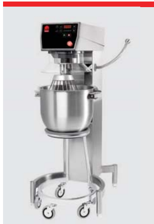
Stainless steel, 30 L