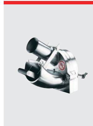
Vegetable cutter GR20