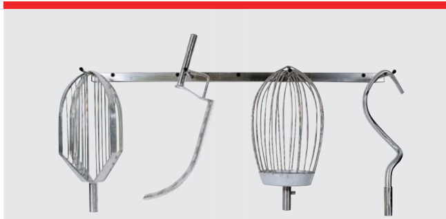
Tool rack, 91 cm