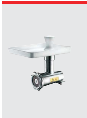
Meat mincer, 70 mm