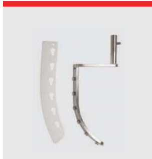
Automatic scraper in stainless steel. Nylon or teflon blade. 30L and 30/15L.