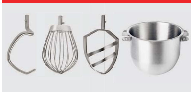
Hook, whip, beater and bowl 30 L in stainless steel.