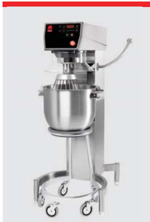
Marine version, stainless steel, 30L