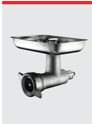
Meat mincer, 82 mm