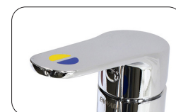
Blue/Red and Blue/Yellow colour indicator handles included