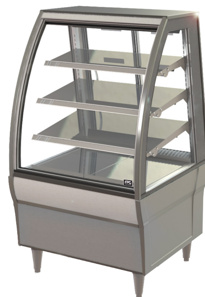
Showing : Inline 4000 Series refrigerated 800mm curved freestanding fixed front with integral refrigeration